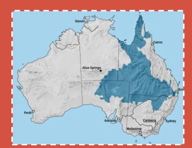
The Great Artesian Basin, Australia

is the Great Artesian Basin in Australia. It covers 1.7 million square kilometres, equivalent to about a quarter of the entire country and 7 times the area of the UK.