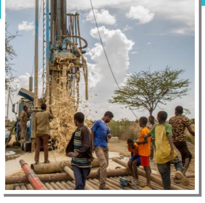
Drilling a groundwater borehole in Ethiopia

Groundwater scientists called hydrogeologists can find groundwater in all sorts of areas, including beneath deserts. Rocks containing groundwater which can be extracted are known as aquifers . Some rocks make better aquifers than others, and finding them isn't as simple as just digging a well. Hydrogeologists use a range of different information and scientific methods to understand and predict groundwater.